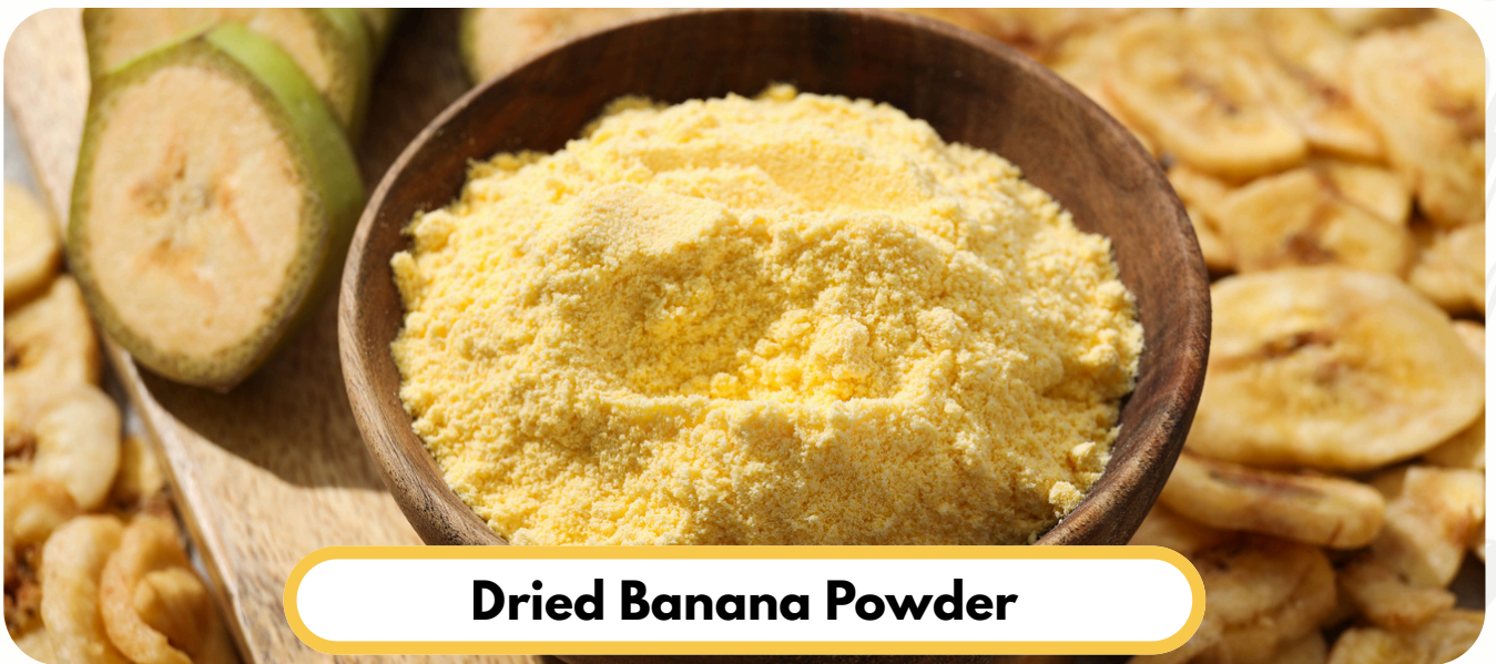
Dried Banana Powder