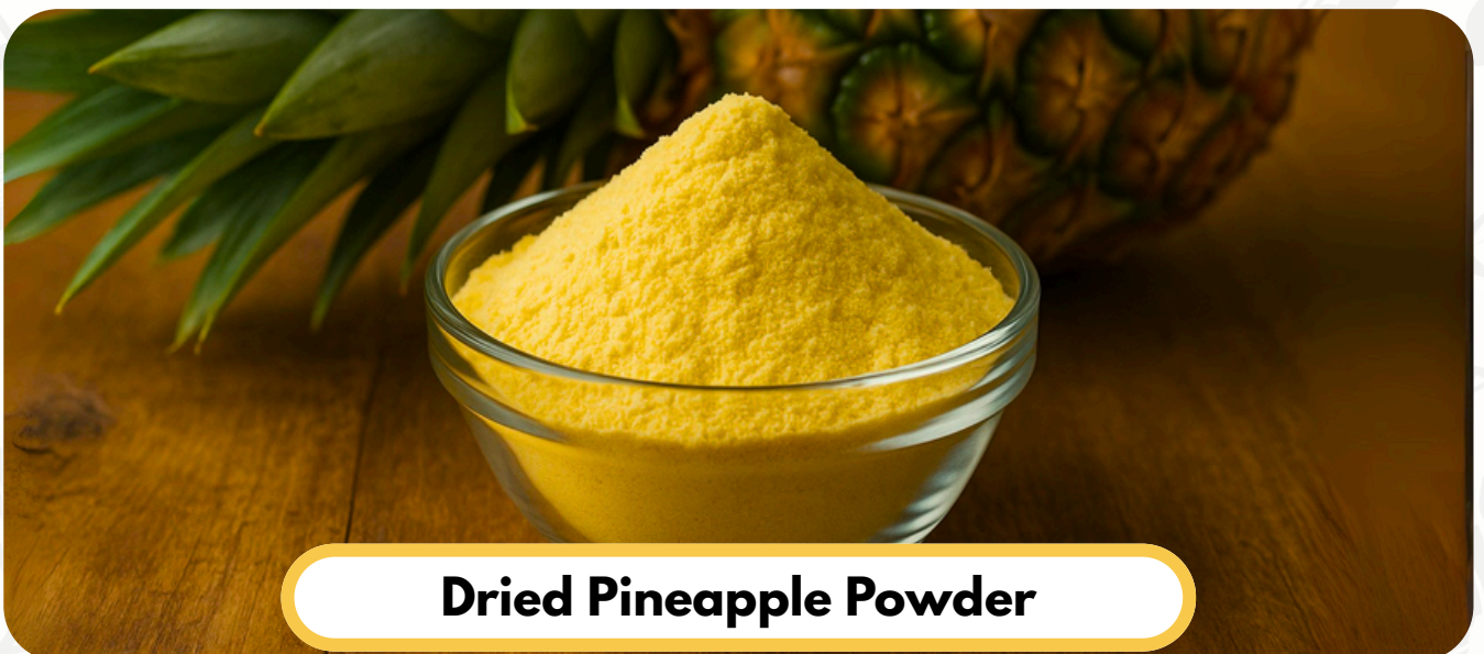
Dried Pineapple Powder