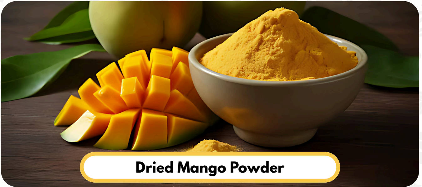
Dried Mango Powder